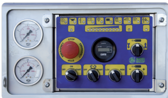
ANTISHOCK control panel with electromechanical controls