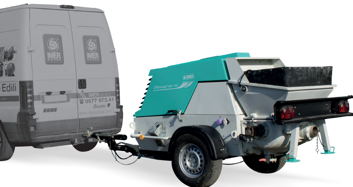
Booster 15 R (road-towable version)