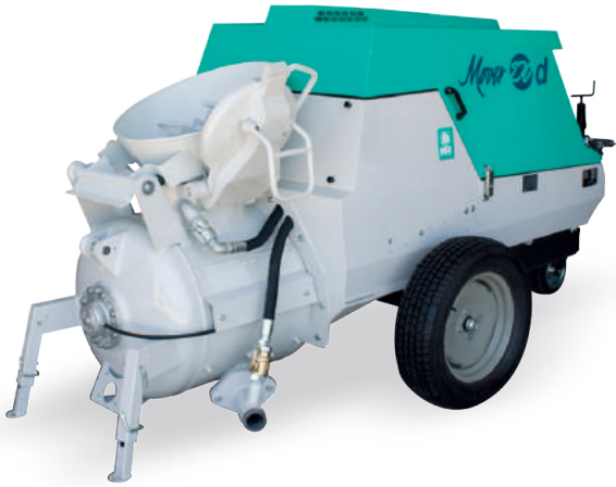
↑ MOVER 270d Diesel engine Cod. 1106025