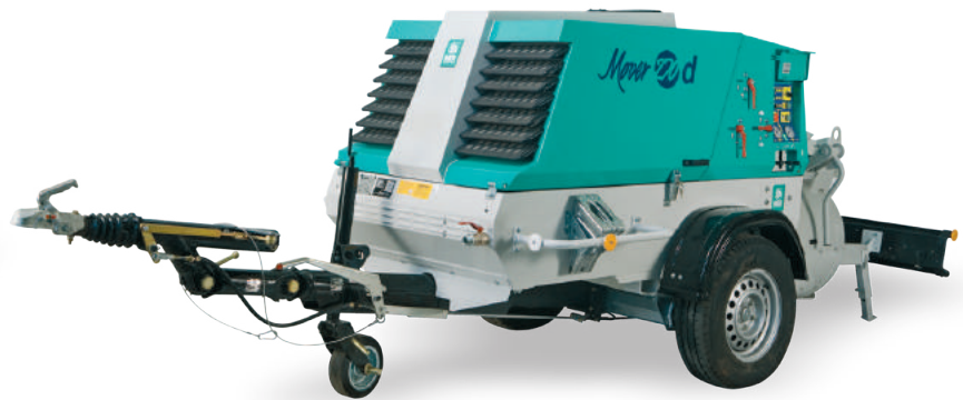
↑ MOVER 270dr Diesel engine Towable Cod. 1106019