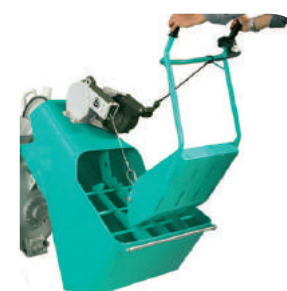
Cable and rope coilers with scraping shovel (Optional) Cod. 1107055 (Mover 190db)