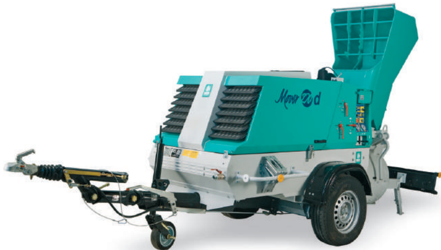
↑ MOVER 270dbr Diesel engine • Towable • With loading bucket Cod. 1106020

MOVER WT (without hoses) are equipped with: discharge stand, material hose hanging system, gaskets, output manifold and accessories box for hose cleaning. (for details on WT versions see the price list)