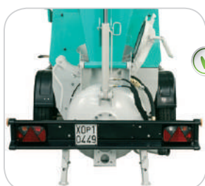
✓ Road-towable drawbar with lights (road-towable version "R")