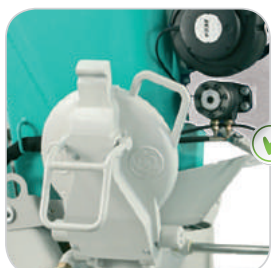
✓ Hatch with built-in safety valve for easy and safe handling