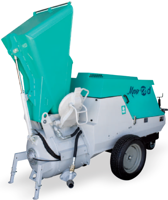
↑ MOVER 270db Diesel engine With loading bucket Cod. 1106026